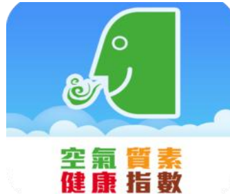
Air Quality Health Index