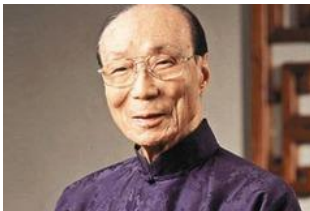
A philanthropist often donates money to the needy.