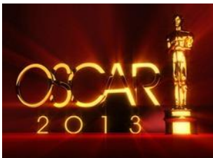
The Academy Award is also called the Oscars.