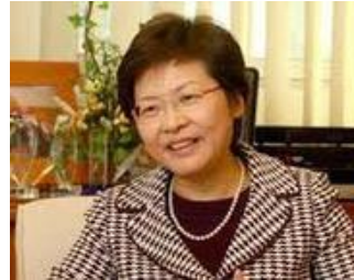
Chief Secretary for Administration