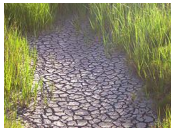
A drought means a long period of time with little or no rain.