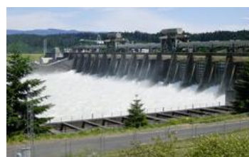
Dams have to be built to generate electricity through hydroelectric power .